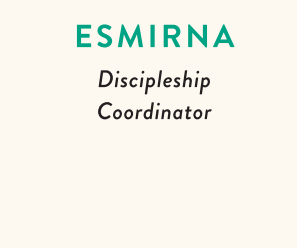
ESMIRNA Discipleship Coordinator

"We had plans to eventually start a Discipleship Program in San Carlos, but this one began differently from the other communities - the people asked for it! They knew about SuNica's work in Limonal, Salinas, and Porvenir and recognized it as something good and necessary for their kids. We started with the Mentorship program to train a group of pre-leaders, and it's been incredible seeing the growth in every one of them and how engaged they are with the process."